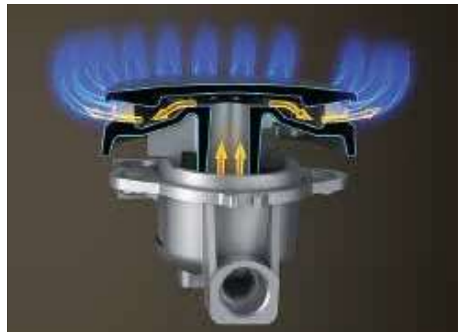
HIGH EFFICIENCY BURNER* 20% MORE EFFICIENT