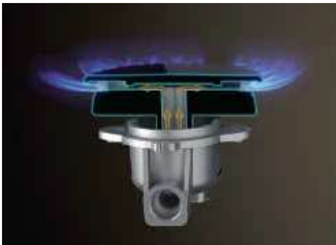
STANDARD* BURNER *Medium-fast burner.

The new burner conformation perfects the gas jet, to produce a more direct and vertical flame. Result: less heat dispersion and 20% more efficiency, creating obvious savings in time and resources.